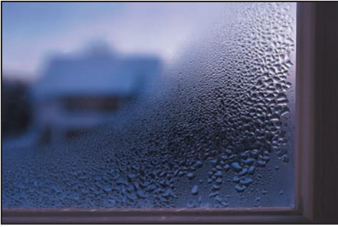
Condensation on the inside of a window-pane.